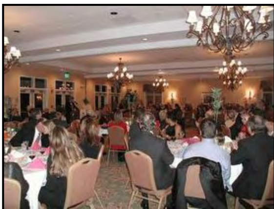
Banquet & Meeting Space