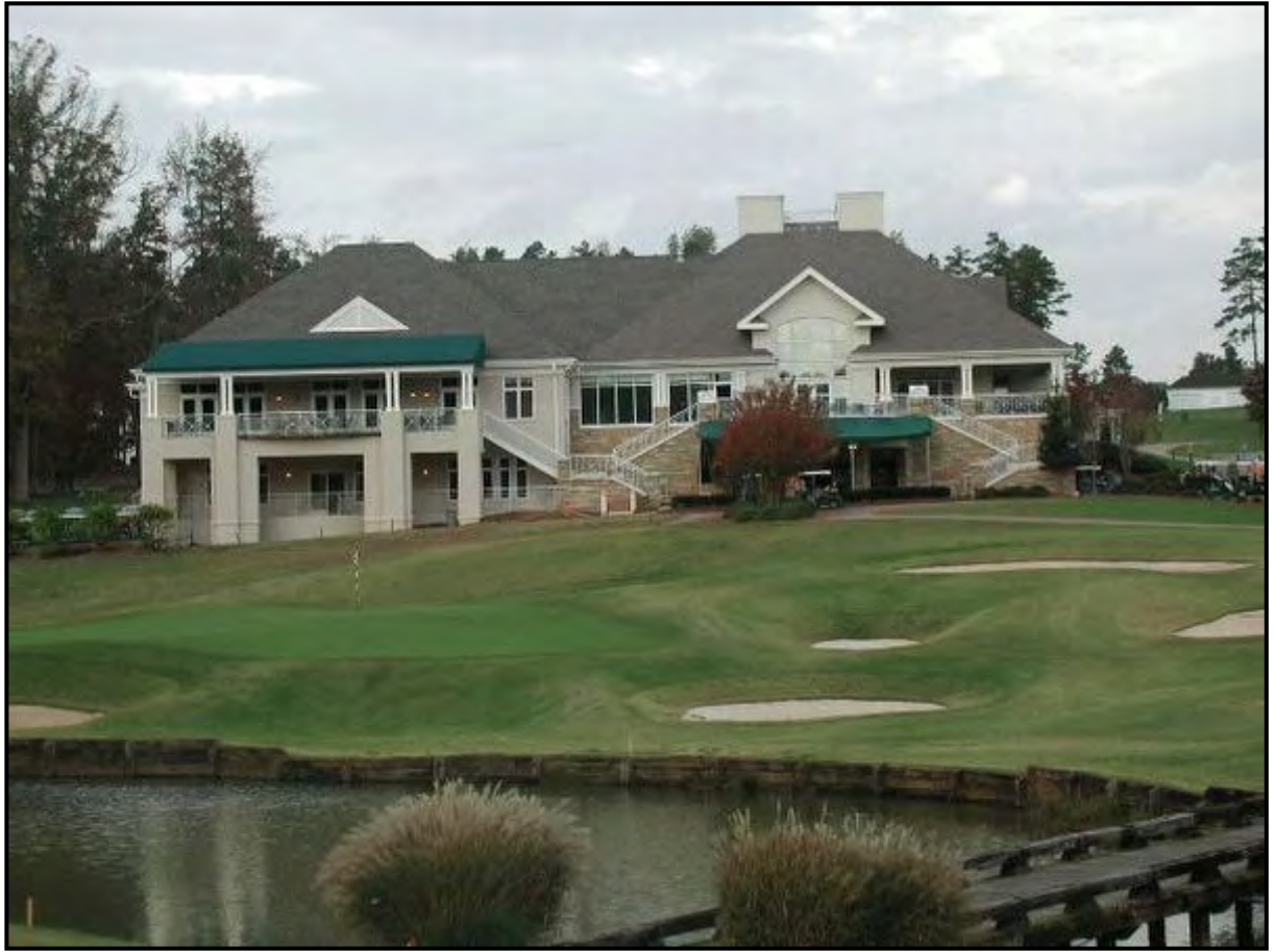
Back of Clubhouse

The Reserve is heavily wooded and has wonderful views of the fairways.