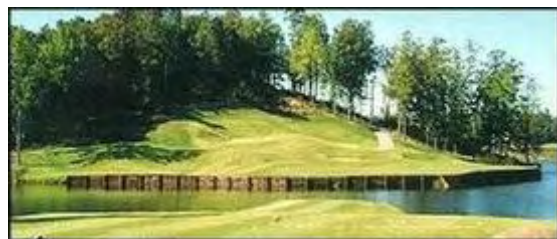
Hole 13 - The Signature Hole