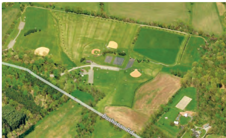
NEARBY DILTS PLAYING FIELDS ON BUCHANAN ROAD