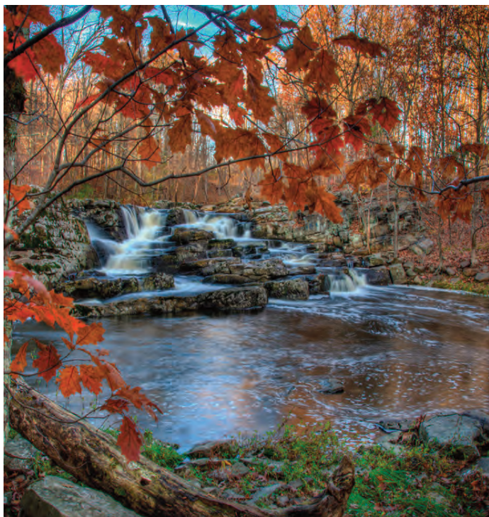
LEFT, WICKECHEOKE CREEK - JUST A COUPLE OF MILES FROM THE PROPERTY WITH HIKING TRAILS AND VISTAS OF NATURAL BEAUTY

FOR A PRIVATE TOUR, CALL BRUCE GAGE 908-892-9055