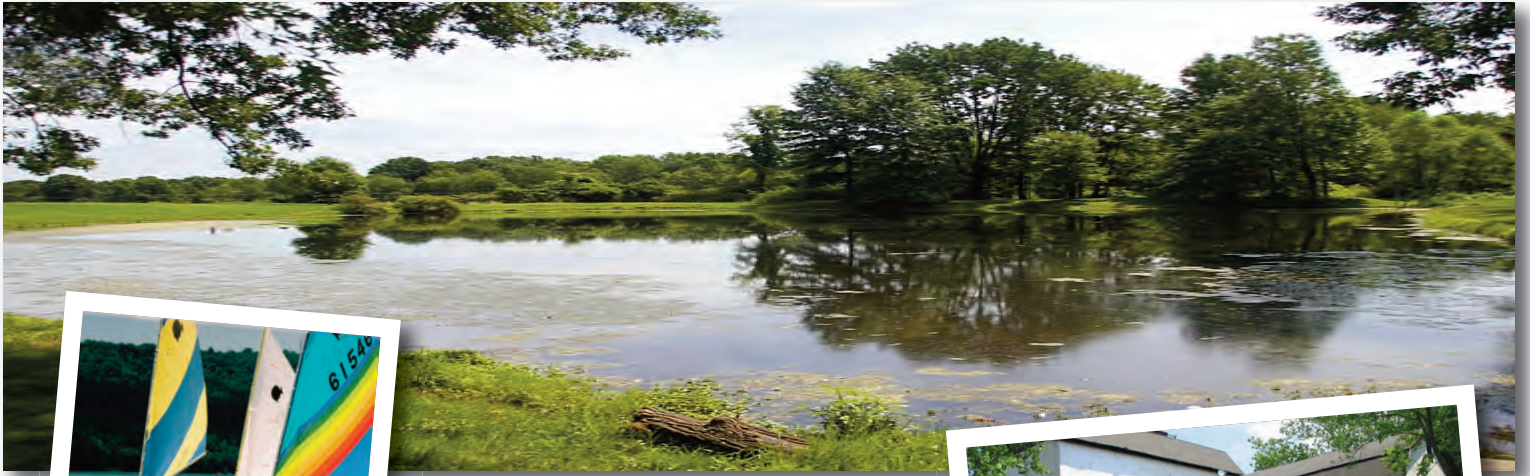
ABOVE, NEARBY SOURLAND MOUNTAIN REGION, 90 SQUARE MILES OF WILDLIFE HABITAT AND HIKES