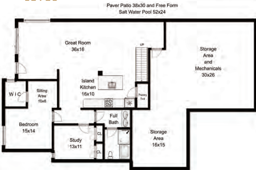
FINISHED LOWER LEVEL

To see many more photos with interactive floor plans go to: