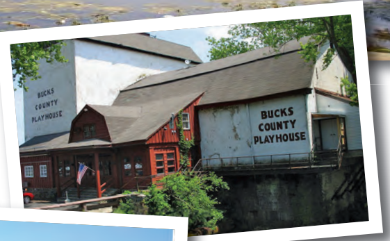
ABOVE, LOTS OF GREAT LOCAL THEATER LIKE THE BUCKS COUNTY PLAYHOUSE IN NEW HOPE